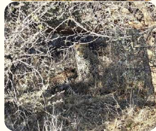
Coats usually match the environment; a lioness with a plain coat in the Kalahari, and a leopard and her cub with rosettes in their coat in dense woodland.