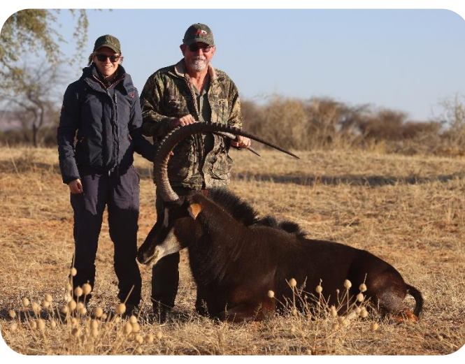
July Check out this impressive sable bull, he measured a whopping 50"!

Venasha was then introduced to orphan Lily. A few months later, as you might have heard, tragedy struck as Lily died of complications after a heavy parasite infestation. This parasite, living in the gut, is very resistant and and the first case reported in rhinos. Venasha also has the bug, but so far she is doing well. She has already become a big lady of over 200 kg!